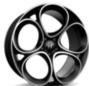
19" 'Dark Petal' (Code 9GF)