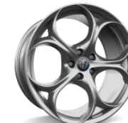
19" 'QV Silver' (Code 74A)