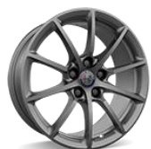
17" 'Style' (Code 420)