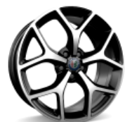
19" 'Dual-spoke' (Code 6G7)