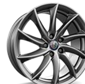
18" 'Turbine' (Code 4WQ)