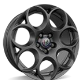
17" 'Sport' (Code 433)