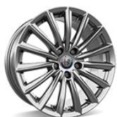
17" 'Elegance' (Code 439)