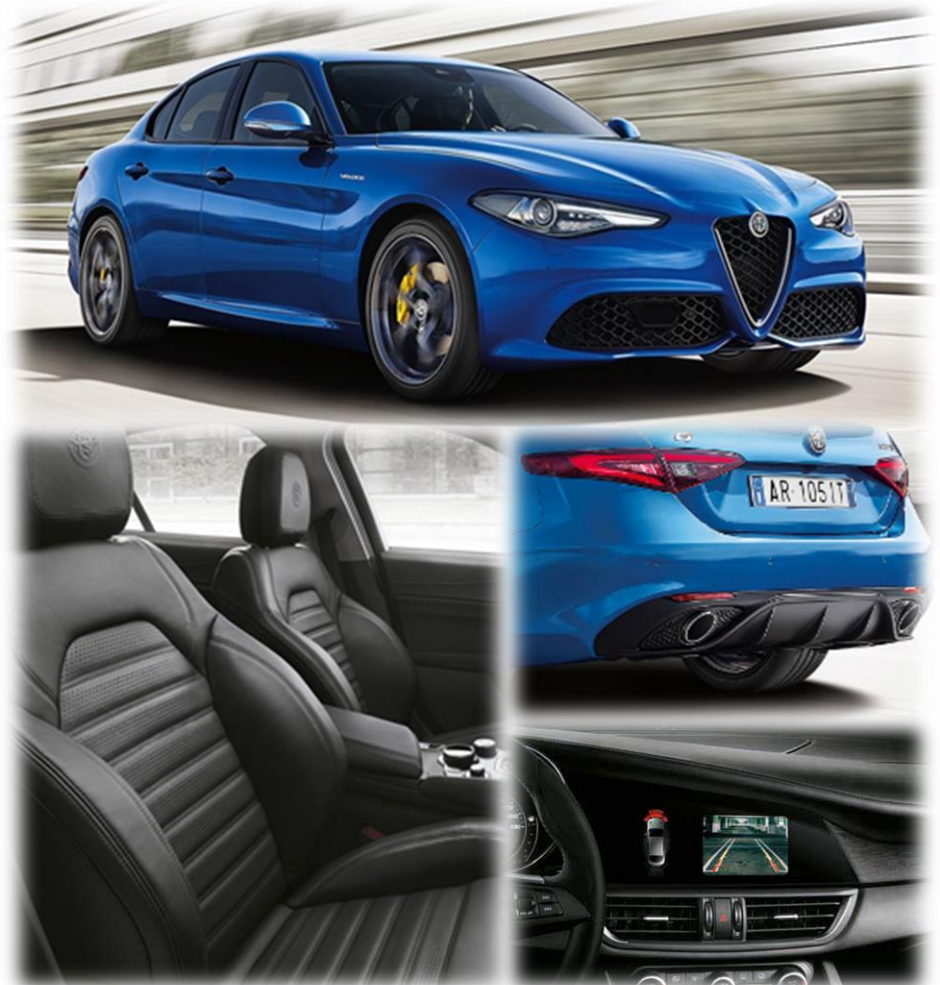
Exterior colour shown is optional 'Misano Blue' metallic paint.

Front & rear park distance control & Rear view camera w/ dynamic gridlines