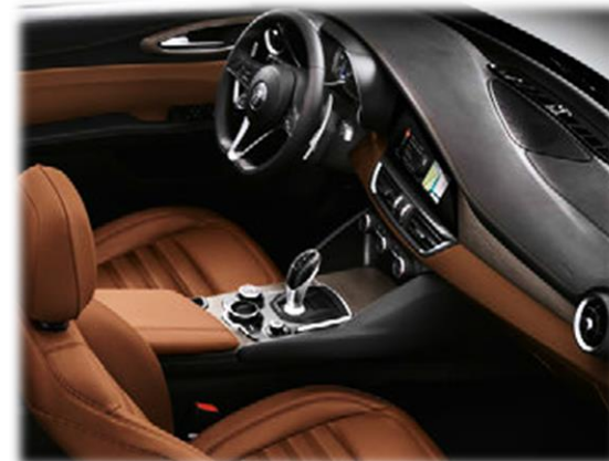
Tan "Pieno Fiore" leather w/ Grey Oak inserts (Interior code 577 + 9KV)