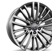
18" 'Luxury' (Code 4AY)