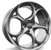
19" 'Veloce Silver' (Code 6Y8)