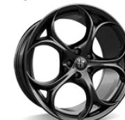
19" 'QV Gloss' (Code 5YN)