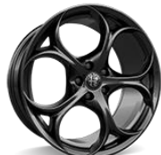
19" 'Veloce Gloss' (Code 5EQ)