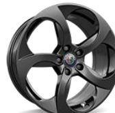
18" 'Dynamic' (Code 68P)