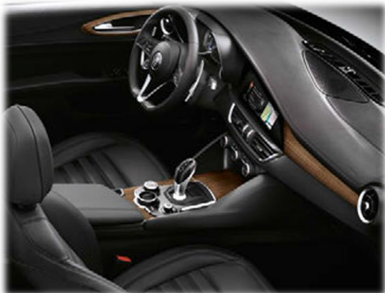
Black "Pieno Fiore" leather w/ Walnut inserts (Interior code 499 + 9GU)

Available exclusively for the Veloce trim, the optional Lusso packs provide a crafted finish that only Italian styling can achieve. Key features include 'Pieno Fiore' grained Nappa leather upholstery, luxury leather wrapped instrument / door panels, real wood decorative inserts.