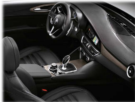
Black "Pieno Fiore" leather w/ Grey Oak inserts (Interior code 485 + 9KV)