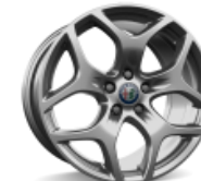
18" 'Dual 5-spoke' (Code 6G6)