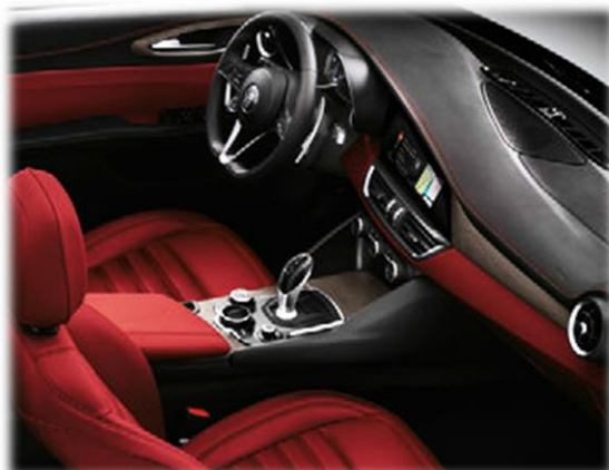
Red "Pieno Fiore" leather w/ Grey Oak inserts (Veloce interior code 562 + 9KV)