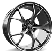
19" 'Performance' (Code 5ER)