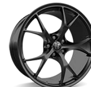
19" 'Performance Gloss' (Code 73Z)