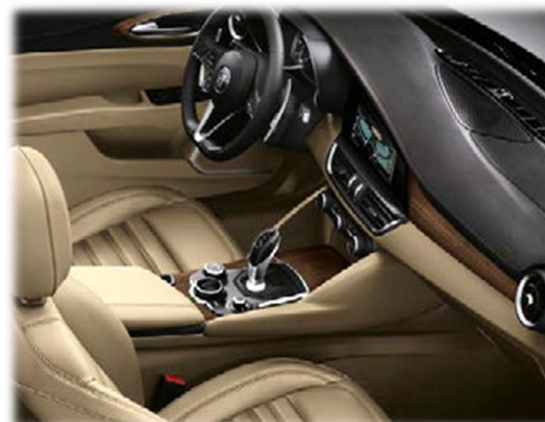
Beige "Pieno Fiore" leather w/ Walnut inserts (Veloce interior code 501 + 9GU)

All the colour images on this page are matched as accurately as possible to the actual upholstery colours used. However, due to print processes, Alfa Romeo Ireland cannot guarantee that colours shown are 100% accurate. Please contact your local Alfa Romeo dealer for more information.